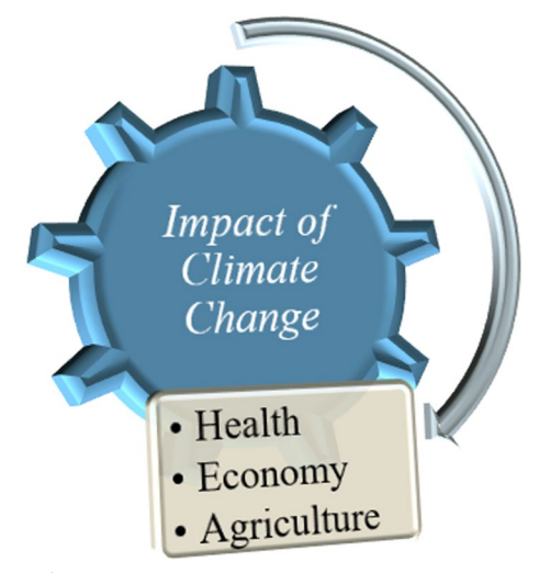
Fig. 2 The impact of climate change